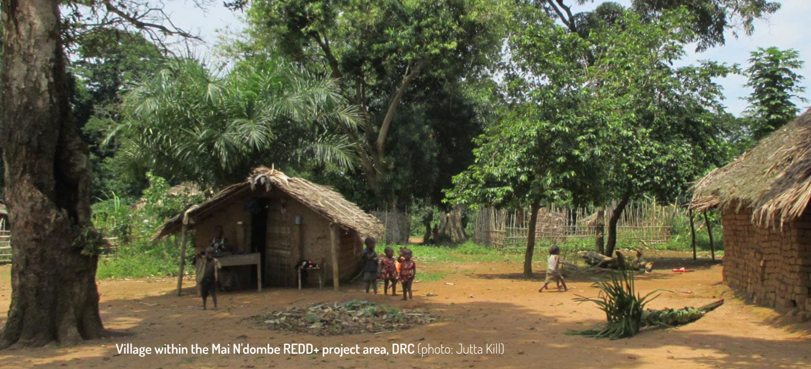
Village within the Mai N'dombe REDD+ project area, DRC