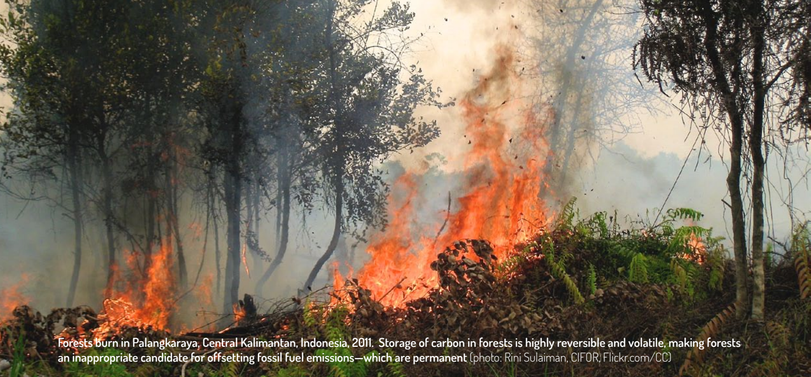
Forests burn in Palangkaraya, Central Kalimantan, Indonesia, 2011. Storage of carbon in forests is highly reversible and volatile, making forests an inappropriate candidate for offsetting fossil fuel emissions—which are permanent