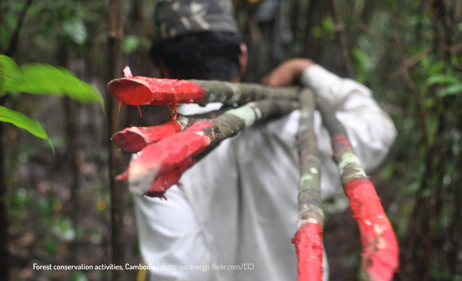
Forest conservation activities, Cambodia

"When I told villagers they were supposed to be paid for their efforts, many were shocked and angry to the point of tears"