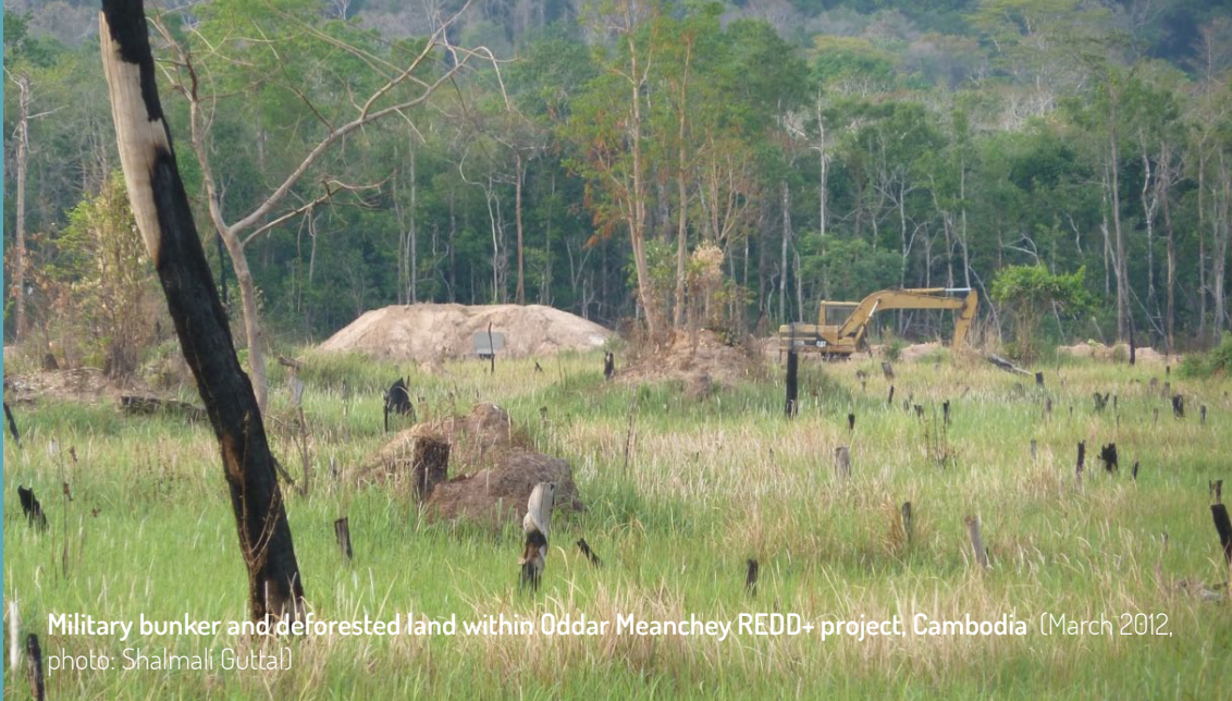
Military bunker and deforested land within Oddar Meanchey REDD+ project, Cambodia (March 2012)