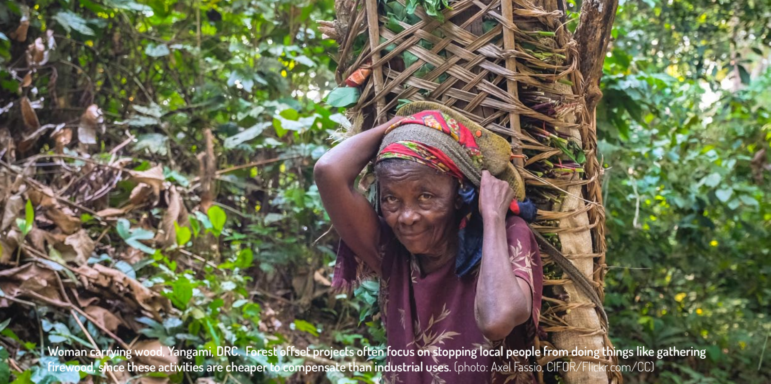
Woman carrying wood, Yangami, DRC. Forest offset projects often focus on stopping local people from doing things like gathering firewood, since these activities are cheaper to compensate than industrial uses.

"Generations of forest-dependent peoples face disruption to their ways of life, exclusion from their traditional sources of income and livelihood, and even criminalisation and conflict so that wealthier people can reassure themselves that their weekend city-break flight is, on balance, causing 'no net harm'"