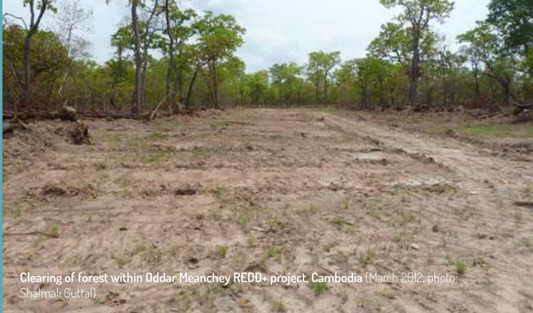
Clearing of forest within Oddar Meanchey REDD+ project, Cambodia (March 2012)

"In many of the sites more than half of the forest has disappeared. The REDD programme has been powerless to stop these processes"