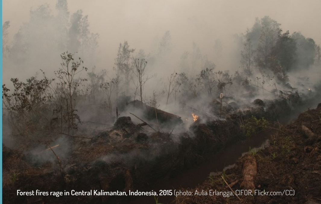
Forest fires rage in Central Kalimantan, Indonesia, 2015

"Forests — for example in Indonesia, Brazil, Australia, Canada, the USA or Portugal — usually burn on a large and uncontrollable scale, and the adjacent 'buffer' zone is often equally vulnerable to fire"