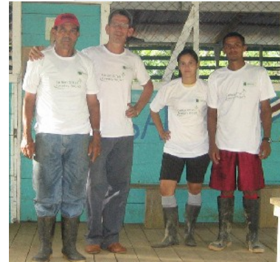
The Silva Tree team performing repairs at a local school in Costa Rica