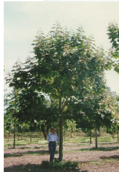
Paulownia aged 1 year

Paulownia is famous for its extraordinary growth rate