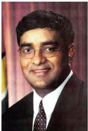
圭前任总统 巴拉特·贾格迪奥