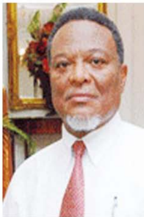
圭亚那总理 塞缪尔·海因斯