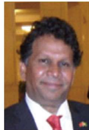
圭亚那驻华大使 戴维·达比丁