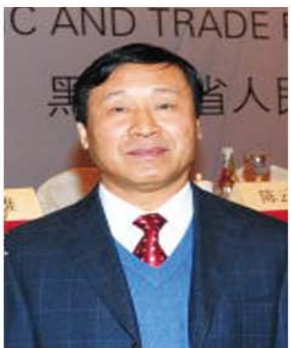
著名经济学家 省科顾委主任 陈永昌