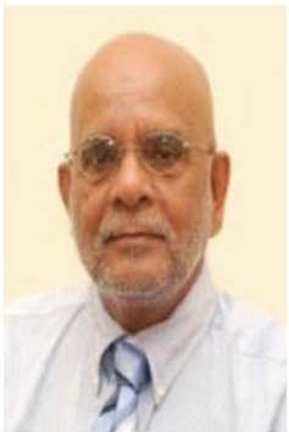
圭亚那投资部部长 戴斯蒙德·默罕默德