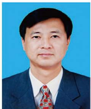
黑龙江省副省长 孙尧