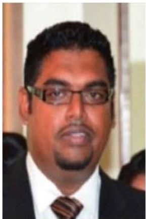
圭亚那住建部部长 伊尔凡·阿里