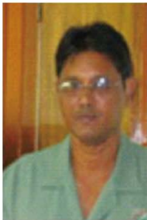
圭亚那森林局局长 辛格