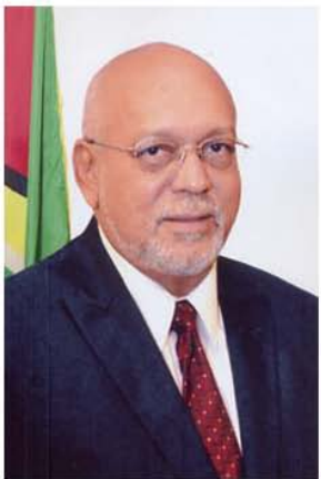
圭亚那总统 萧纳德·拉莫塔