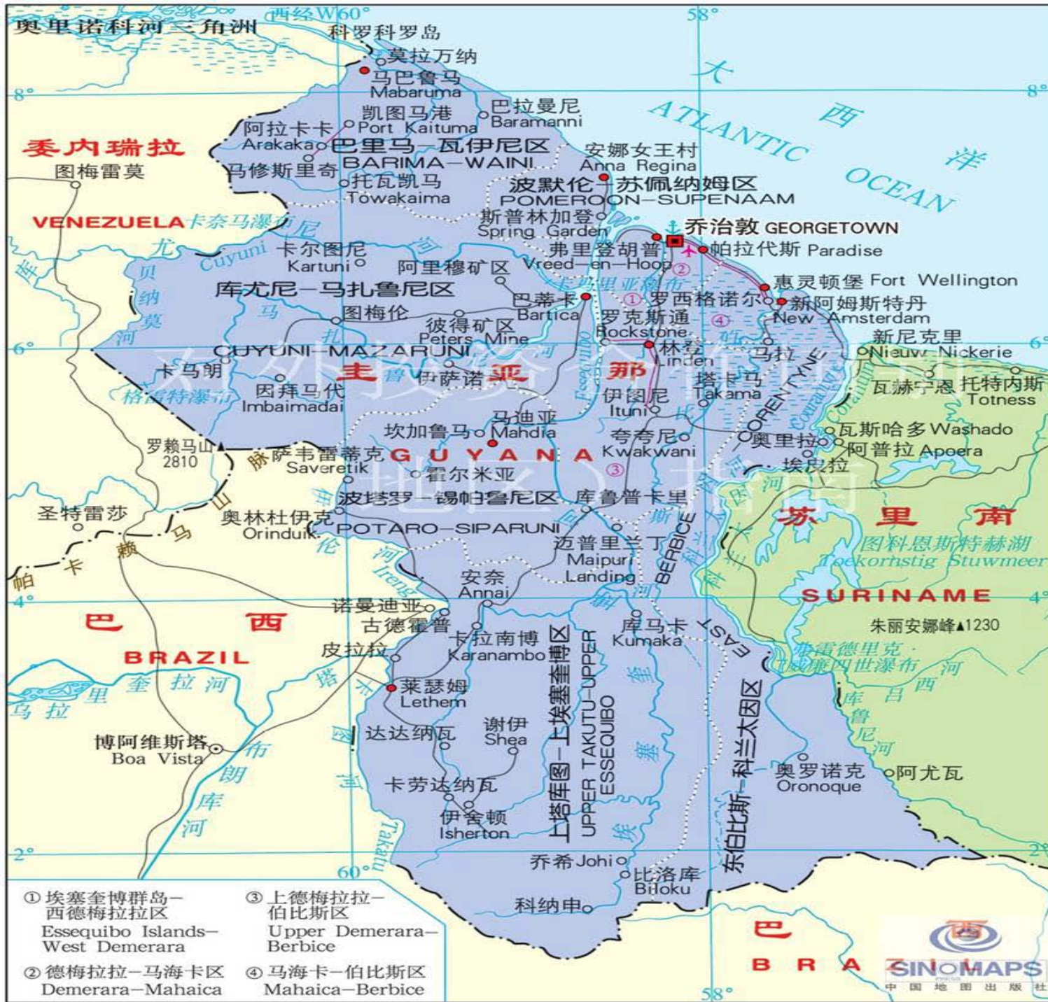
Map of Guyana