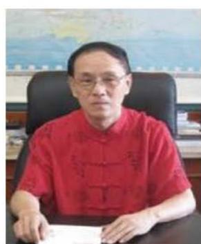
驻圭大使馆大使 于文哲