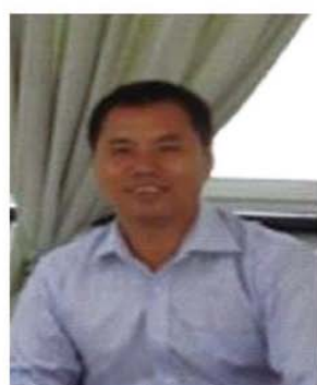
驻圭使馆经商参赞 欧阳俊