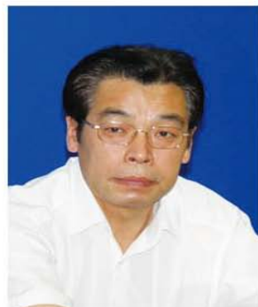
黑龙江省林业厅 厅长 蔡炳华