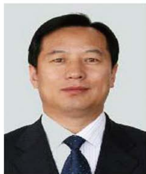
大兴安岭地委书记 肖建春