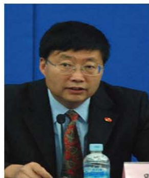
黑龙江省原商务厅 厅长 叶晓峰