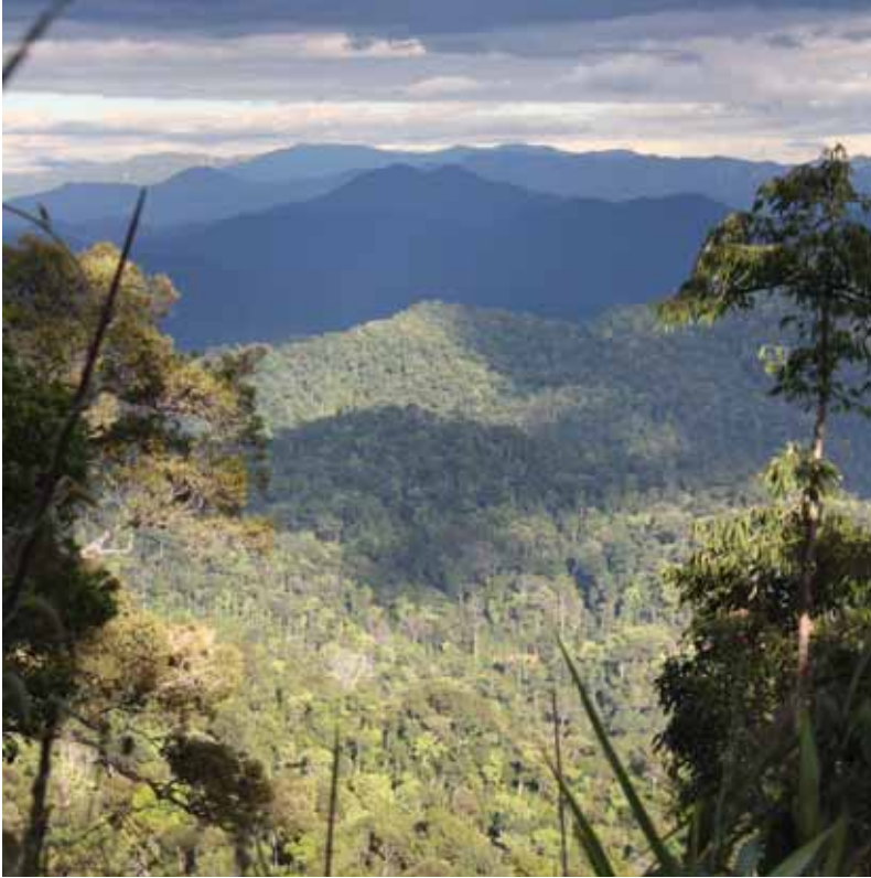
BOTTOM: Forest area cleared for plantation, Attapeu, Laos.

Corruption is widespread in Laos' forestry sector, explaining why national laws are widely flouted. In 2010, a Government prosecutor admitted that the number of forestry officials charged with taking bribes was increasing, with payments being made to inspectors to allow cutting in excess of quotas. 10 In 2010, Laos was ranked the 154th most corrupt country out of 178 assessed by anti-corruption watchdog Transparency International. 11 It has been estimated that 20 per cent of logging companies' total overheads in Laos comprise bribes to senior officials to secure quotas. A further 15-20 per cent goes to lower level officials. 12