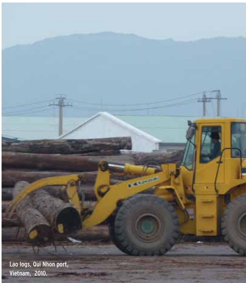
Lao logs, Qui Nhon port, Vietnam, 2010.

Vietnamese companies trading Lao logs also supply international buyers as well as domestic processors. For example, the Hanoi-based company Nicewood has shipped Lao logs to India and China. Internet searches reveal an active international trade in Lao logs; for instance the Vietnamese company Viet Anh Wood Co Ltd offered both yellow balau and keruing logs from Laos for export in 2010, with a monthly availability of 20,000 cubic metres. Traders from other Asian countries are also cashing in on Laos’ forests; Singaporean, Indian and Chinese firms are also involved in trading Lao logs.